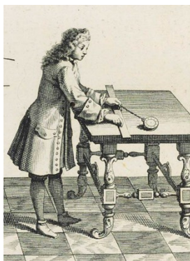
Figure 1. Perrault’s problem as it was imagined by Giovanni Poleni around 50 years later (Poleni, 1729, table).

Broadly speaking, a geometric instrument can be defined as an “artifact”, that is a material object that, among other things, makes a mathematical idea concrete (Randenborgh, 2015, pp. 6ff., and Vollrath, 2003). For example, the Euclidean compass is an object employable in various ways and with different goals; however, when used by students to perform the constructions prescribed in Euclid’s Elements , it encapsulates Euclid’s third postulate, and embodies the real definition of a circle.