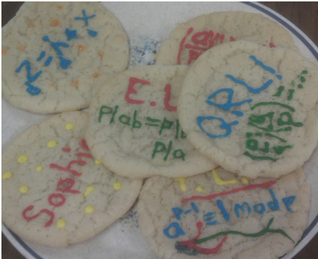
More number theory cookies