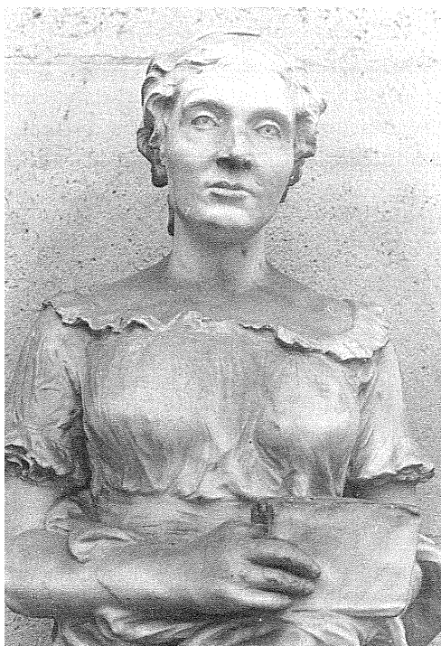
Sophie Germain (1776–1831)

Keywords: Number theory, Sophie Germain, Fermat's Last Theorem, manuscripts, primary sources, original sources, just-in-time, guided discovery, non-lecture, pedagogy