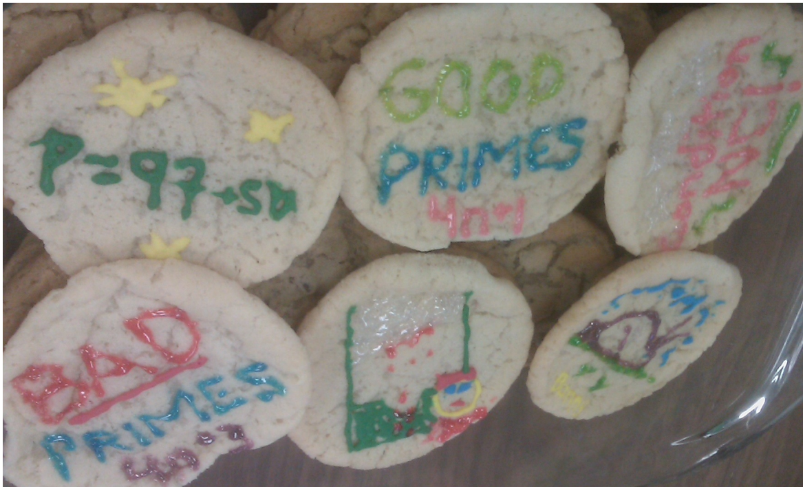
Number theory cookies

I am writing a book for the course based on Germain's manuscripts, with tasks and guidance for student and instructor to follow Germain's path. I endeavor to leave almost all the proofs to the student, with ample guidance and optional further exercises.